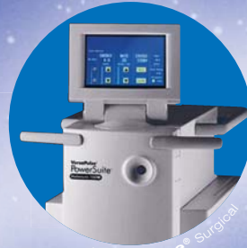
VersaPulse ® Surgical