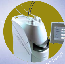
OpusDuo ™ Dental