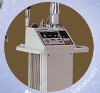
NovaPulse ™ Veterinary