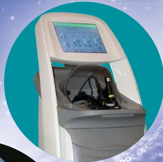
Novus 3000 ® Ophthalmology

The global leader in innovative, life-enhancing applications for medical and aesthetic practices.